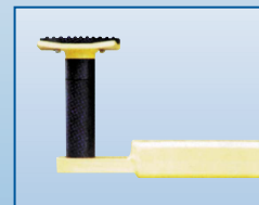
Stackable 3" and 6 ½" adapters